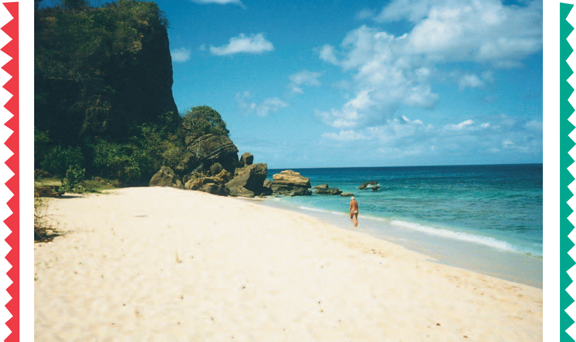
The beach in front